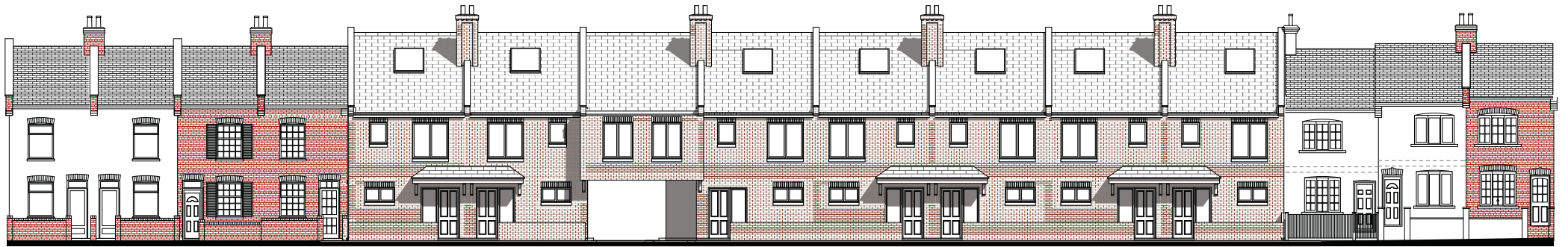
PROPOSED FRONT ELEVATION (JUDGE STREET)